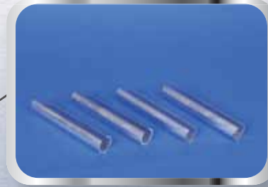
6007 - Straight Joiner