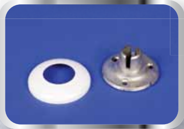
6002 - Straight Wall Return Kit