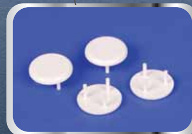
6010 - Rail End Cap