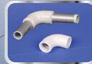
6004 - 90° Corner 6016 - 90° Corner w/ Joiners (not shown)