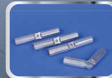
6008 - Adjustable Joiner