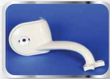
6013 - 90° Inside Corner Bracket Kit (Not Shown)