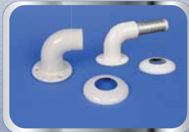
6001 - Wall Return Kit 6017 - Wall Return Kit w/ Joiners (not shown)