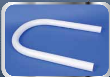
6005 - End Loop