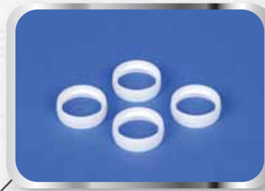
6009 - Joint Ring