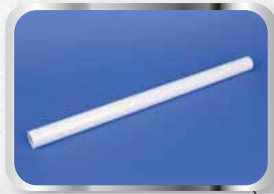
6000 - 104" Rail w/ Stiffener