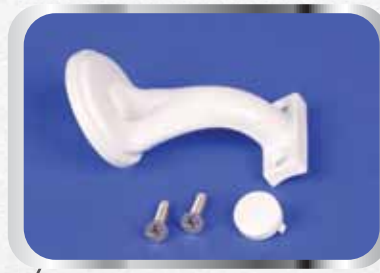
6003 - Handrail Bracket Kit